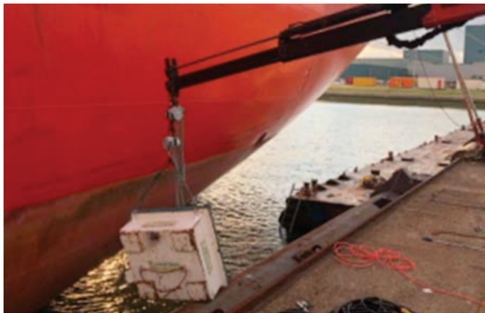
Cofferdam being positioned

The investigation revealed that heat from welding could have caused deformation of the ship's side plating, causing the cofferdam to lose watertight integrity. Also, the flat cofferdam did not form a perfect seal with the hull due to a slight curvature at that location.