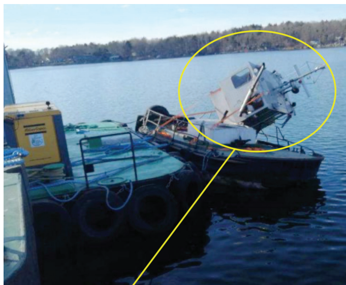
Tug wheelhouse torn from attachments

After the collision the ro-ro proceeded ahead in order to pass the dredging unit, complete the turn and reverse into its berth. The three crew of the dredging unit were unharmed but the tug was listing heavily.