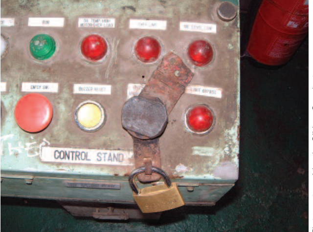
Protective measure to prevent tampering with the luffing limit switch