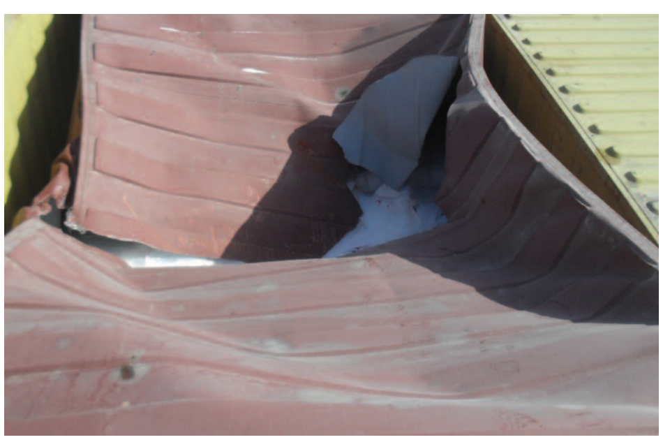
Hoist wire failure caused a crane block to fall on to this loaded container, causing considerable damage

During cargo operations the duty officer should watch out for any signs of poor crane driving, particularly if the vessel's cranes are being operated by stevedores or other third parties. If improper crane handling is observed, the duty officer should stop the crane immediately and explain their concerns to the foreman and the crane driver. If a critical situation appears to be developing it may be necessary to activate the crane's emergency stop, but only if it is safe and practicable to do so. Should the vessel's cranes continue to be operated in an unsatisfactory manner in spite of such measures, the Master should issue a Letter of Protest to everyone concerned. The vessel should also try to take photographs and/or video footage of cranes that are being operated in an unacceptable manner in order to mitigate any related claims that may arise.