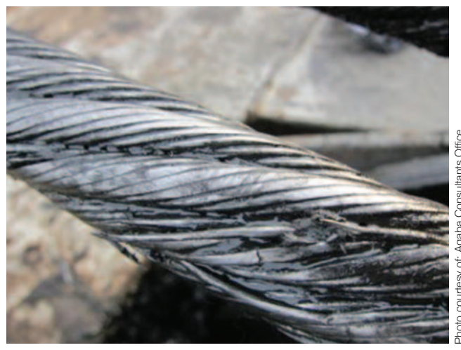
Hoist wire damage