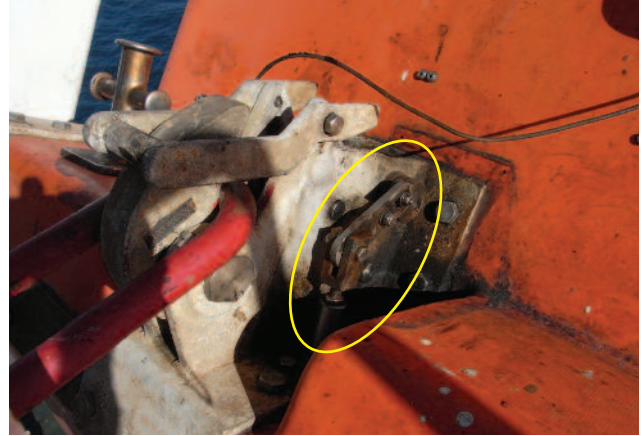
Lifeboat hook arrangement secured to long link. Note the hydraulic ram and link arrangement (circled)