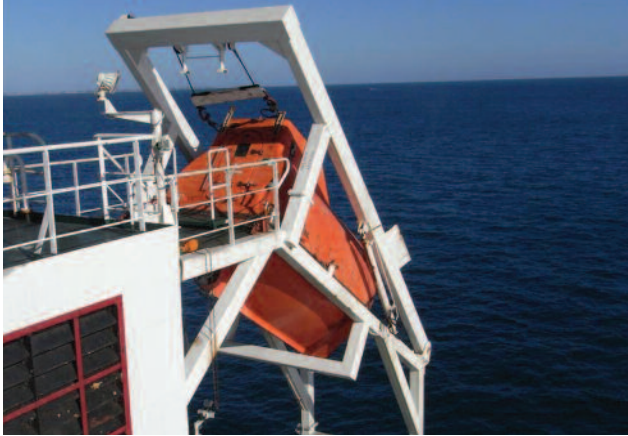
Freefall lifeboat and davit arrangement