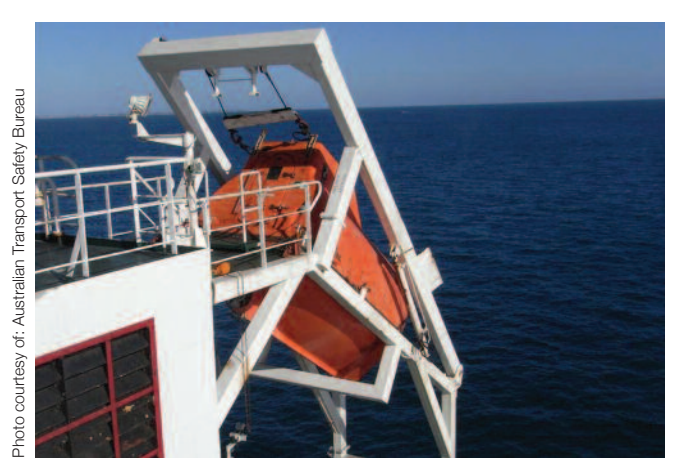
Freefall lifeboat and davit arrangement