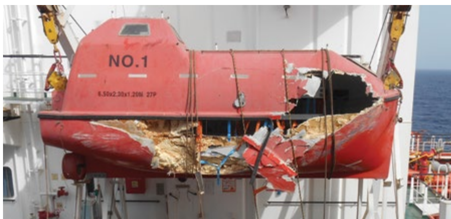
Severe damage to a lifeboat caused by contact with the port shoulder of another tanker whilst it was manoeuvring alongside

Once the vessels are in close proximity, the mooring lines should be passed across in accordance with the mooring plan. Lines should not be over-tightened when making fast to avoid pulling the bows too closely together or, in the case of an anchored vessel, straining the anchor cable.