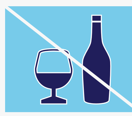
Reduce alcohol consumption