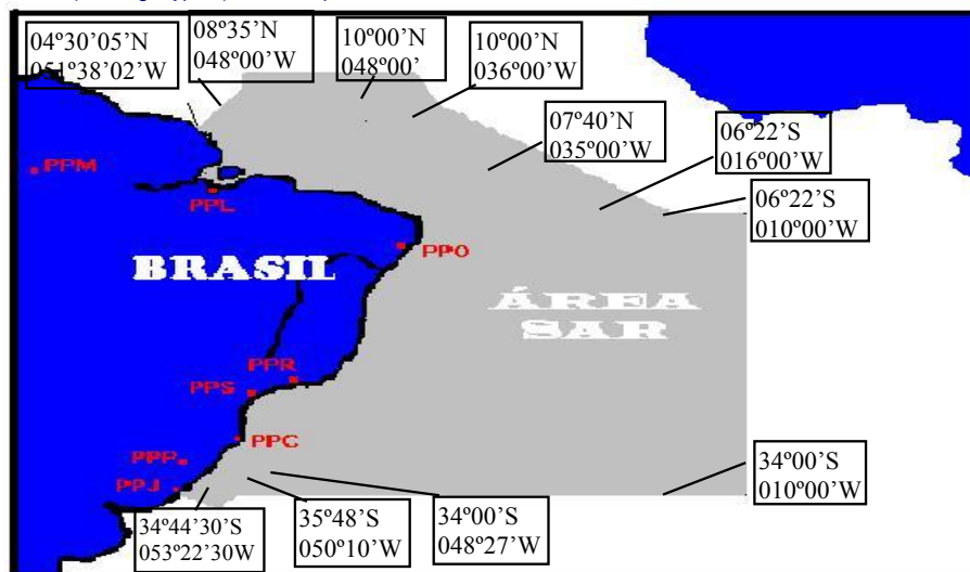
FIGURE 1 - THE SAR AREA FROM BRAZIL / AREA MONITORING BY SISTRAM

Naval Command Control of Maritime Traffic Building Almirante Tamandaré - 6th floor of the Square barão de Ladário, s / n, Centro Rio de Janeiro - RJ - Brazil CEP: 20091-000 Tel. (55-21) 2104-6353 / 6337 FAX: (55-21) 2104-6341 - Home Page - http://www.comcontram.mar.mil.br